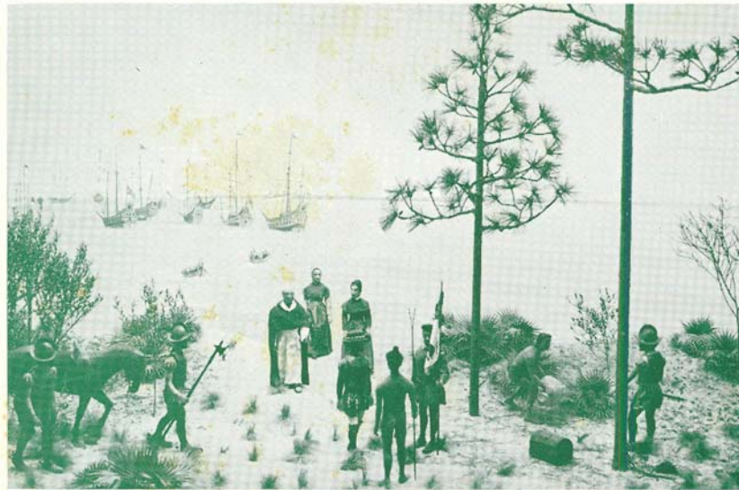
Spanish Conquistador Don Tristan de Luna Landing on the Gulf Coast of Florida in 1559.